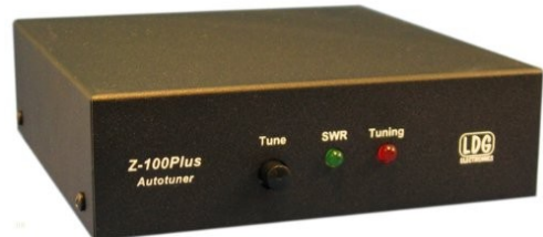
Automatic ("auto") tuner

So, why do we call a tuner a tuner ? What exactly does it tune ? Imagine an antenna that you've purchased or built. Also imagine that your antenna requires some sort of matching section, such as a gamma match or a hairpin match or toroidal 4:1 balun, or window line in the case of a G5RV antenna. The purpose of that matching section is to make your 200-ohm or 450-ohm antenna appear to the transceiver like it's a 50-ohm antenna.